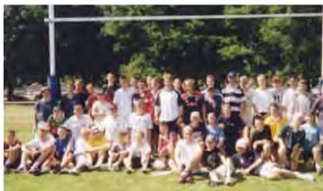
Australian World Cup Winner, Tim Horan, July 2003

Full payment must be received ten weeks before departure. Places are limited and applications are accepted strictly on a first come first serve basis.