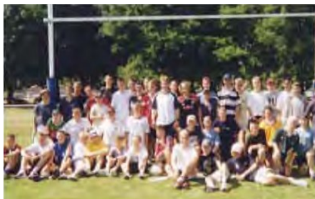
Australian World Cup Winner, Tim Horan, July 2003

Full payment must be received ten weeks before departure. Places are limited and applications are accepted strictly on a first come first serve basis.